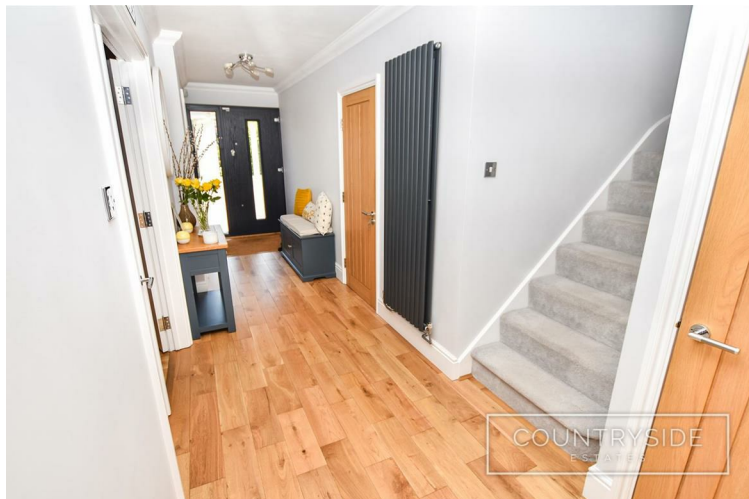
Entrance Hall 5'2 x 25 (1.57m x 7.62m)

Security entrance door with matching side panel leading to large entrance hall, oak flooring, designer radiator, coved and skimmed ceiling, stairs to first floor, power points.