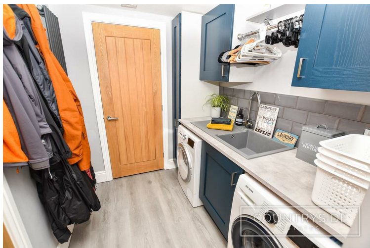
Utility Room 7'2 x 6 (2.18m x 1.83m)

Originally part of the garage, attractive range of fitted units with base and wall cupboards and full height broom cupboard, fitted worktop with grey inset sink and chrome mixer tap, plumbed for washing machine, designer full height radiator, skimmed ceiling with inset lights and extractor fan, door to garage, attractive laminate flooring, space for tumble drier, hanging rail, tiled splash backs to sink area.