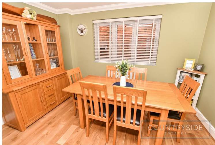
Dining Room 12'2 x 8'8 (3.71m x 2.64m)

Window to flank, glazed double doors to hall, oak flooring, coved and skimmed ceiling, radiator.