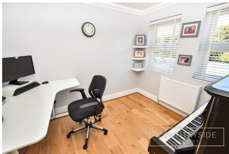
Study 10 x 8'8 (3.05m x 2.64m)

Two windows to front, coved and skimmed ceiling, oak flooring, radiator.