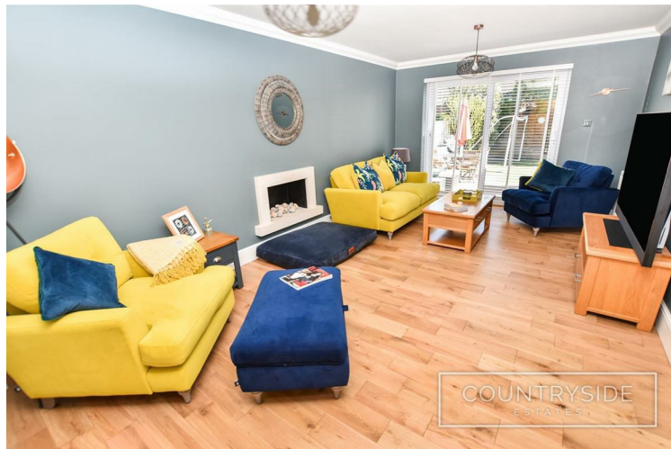
Lounge 19'10 x 11'6 (6.05m x 3.51m)

Patio doors to rear overlooking garden, oak flooring, recessed feature limestone fireplace with remote controlled pebble fire, two wall light points, two radiators.